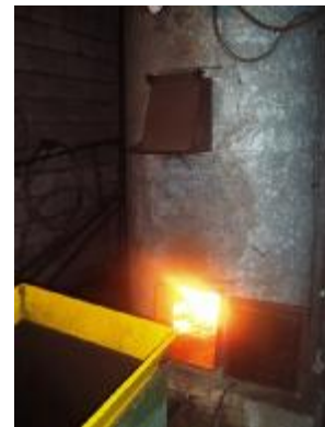
The old coal boiler