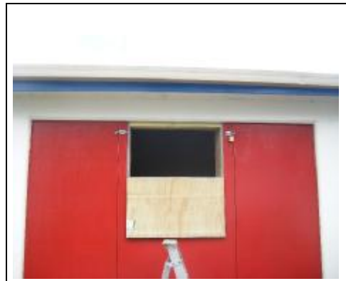
Refurbished bunker with fuel delivery chute

Duncan Mackenzie Solid Energy Ltd 03 345 6125 duncan.mackenzie@solidenergy.co.nz