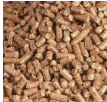
Wood pellets are made entirely from timber processing waste. It is recognised as being carbon neutral.